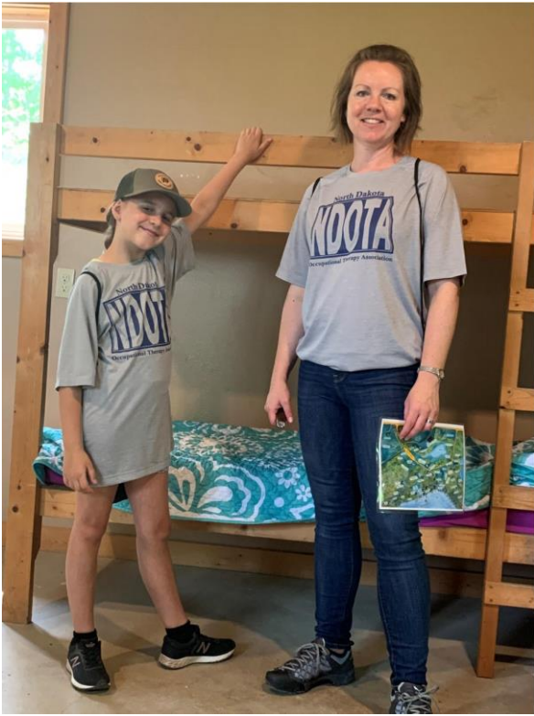
At Prairie Grit's Adventure Camp