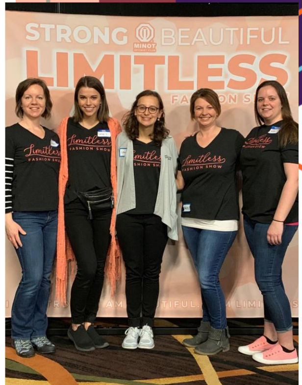
Limitless Fashion Show in Minot