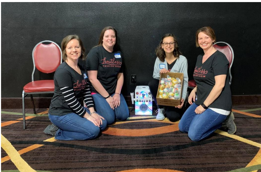
NDOTA members at Limitless Fashion Show